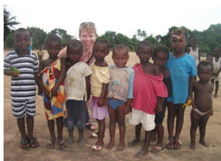
Out of school