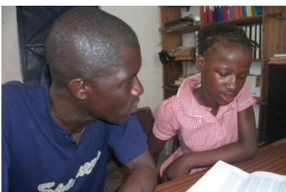
Pupil reading letter from sponsor

The Grand Opening of the new building has been planned for 3 rd April and invitations distributed to the local dignitaries.