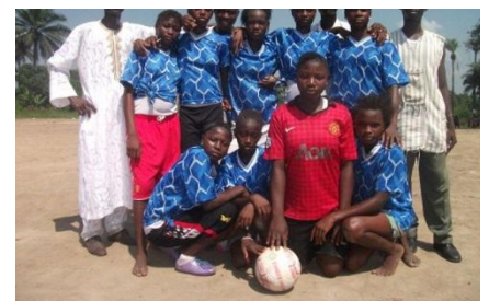
Girls football team