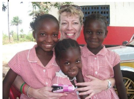
Girls with new uniforms