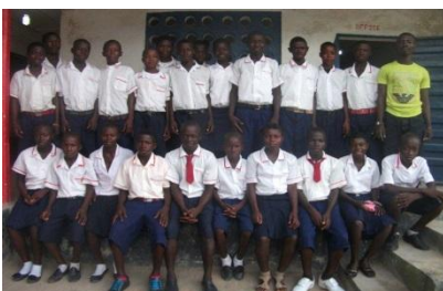
NPSE Graduates, now JSS1