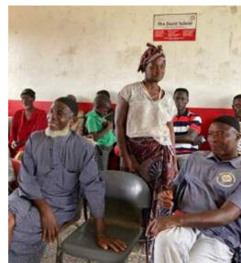
Parents meeting with chief - the man with the beard