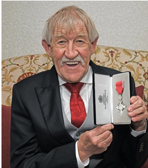
Former headmaster receives MBE for building a school in Africa