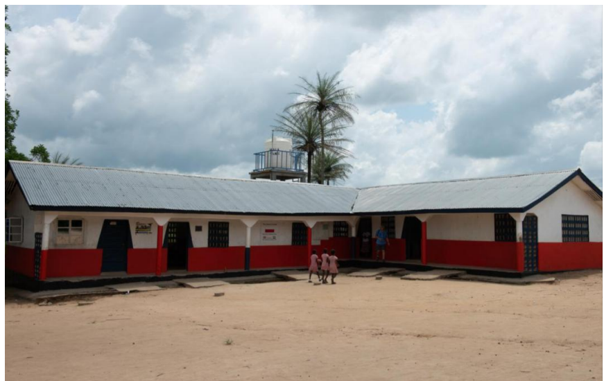
The David School when it was first opened in 2008